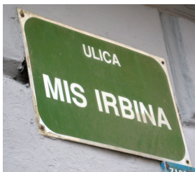
Miss Irby street in downtown Sarajevo

When Bosnia fell into civil war in 1875 and 250,000 refugees flooded across the border into Croatia, she stayed and worked to feed, clothe, shelter, and educate those driven from their homes. At one point she had 2,100 students - all funded by money she raised from England. By conservative estimates, she saved over 50,000 lives.